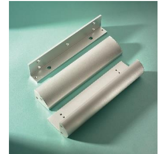
AMH595/ZA Architectural Z&L Bracket to suit Inward Opening Doors