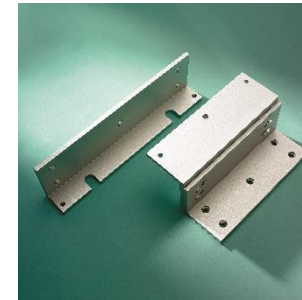
AEMBR026 Z&L Bracket to suit Inward Opening Doors